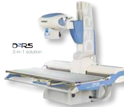
STATIF PRO DREAM Universal systems